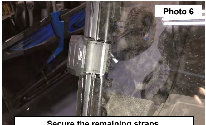
Secure the remaining straps.