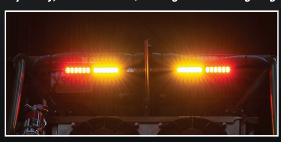
Dramatically improves rider safety on the trail or off-roading through desert terrains for recreational and competative race course use.