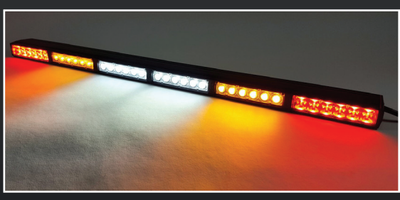
Features include red tail/brake light with blinker capability, amber dust lights with solid or strobe capability, and white flood/work lights for area lighting